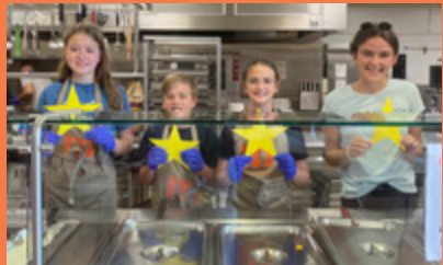
Matt Talbot is one of only six charities in Lincoln and 27 in Nebraska to receive Charity Navigator's highest rating of four stars (July 2022).